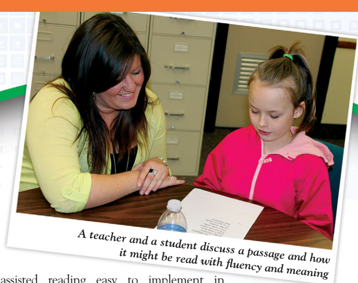
A teacher and a student discuss a passage and how it might be read with fluency and meaning

Reading aloud to students has long been advocated for elementary classrooms. Students who are regularly read to have larger vocabularies, are better comprehenders, and are more motivated to read. In addition, when reading to students, the teacher can help students notice how one's voice can be used to enhance meaning and to make the reading experience more satisfying. Students themselves will develop a better sense of what constitutes fluent reading and can try to make their oral reading approximate the reading produced by the teacher.