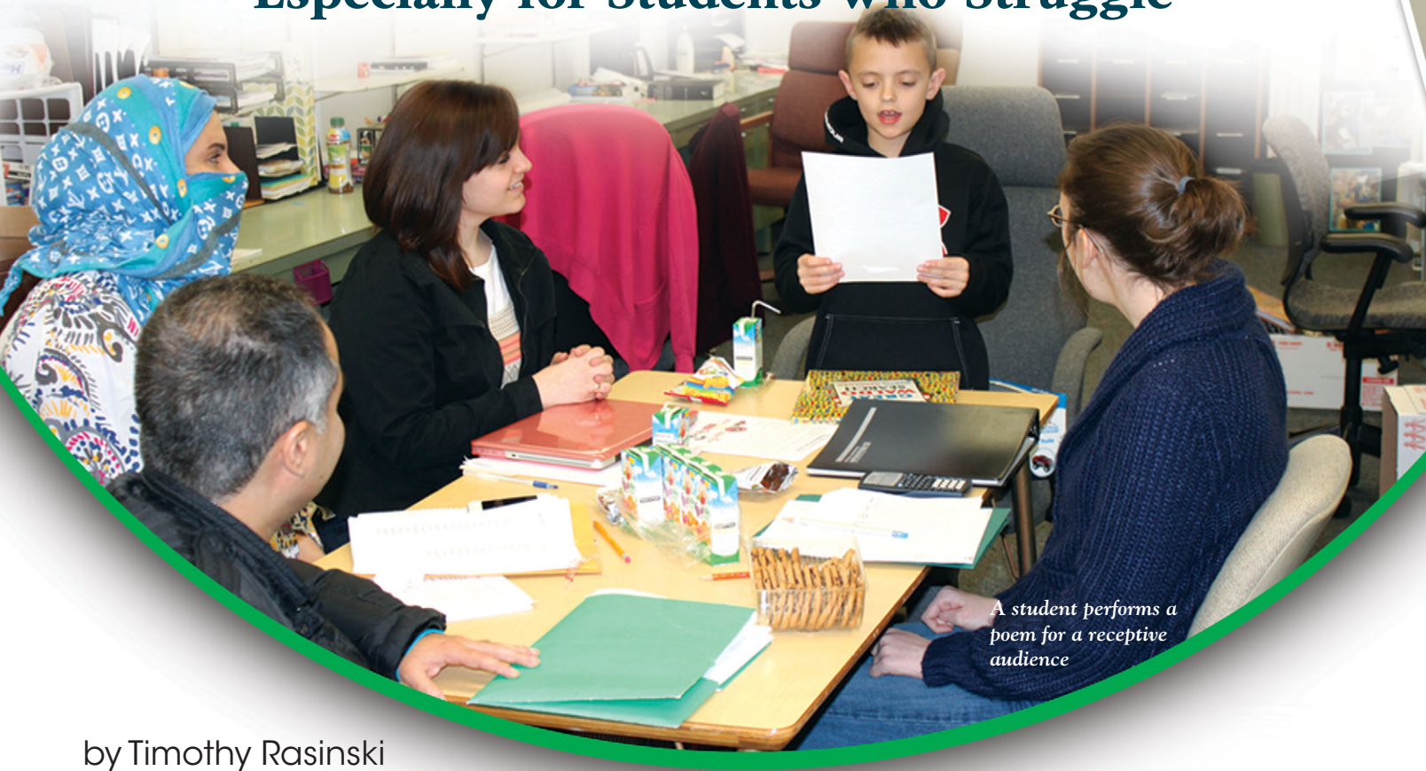
A student performs a poem for a receptive audience